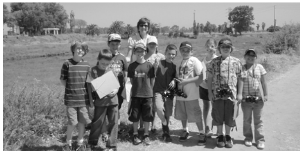
Ocean Beach Elementary Class Field Trip, May 2008

A local author, Richard Louv , has started a national movement with his book " Last Child in the Woods. " He points out that over the decades people have lost contact with nature. The natural world has moved from being a major feature of their lives to be either unnoticed or even feared. He provides substantial evidence that this loss has a negative impact on mental health. His national movement has hit San Diego, his home town, in a big way recently. A large group of organizations and individuals are trying to find ways to reconnect children with nature. The emphasis is on "hands-on" activities. See web site, www.sdchildrenandnature.org .