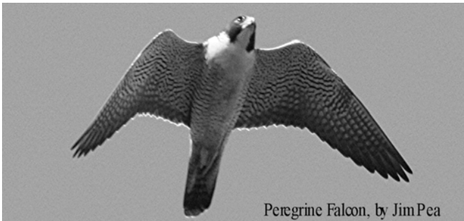
Peregrine Falcon