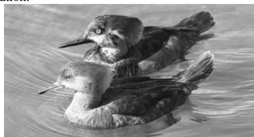
Pair of Juvenile Hooded Mergansers, March 2009

For the past two years, Famosa Slough has also been a stop on a birding trip that is part of the San Diego Bird Festival. This trip is focused on native habitat restoration, and the Slough also provides them a great place for bird observation.